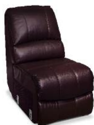
1200 Armless Chair