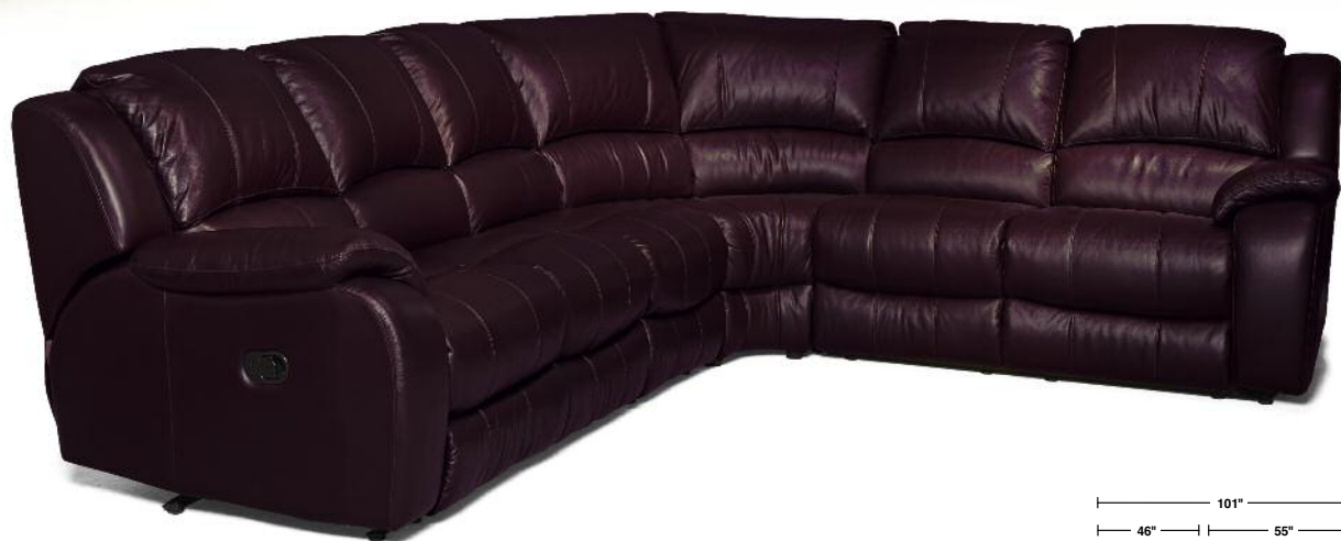
1200 Sectional with Armless Chair