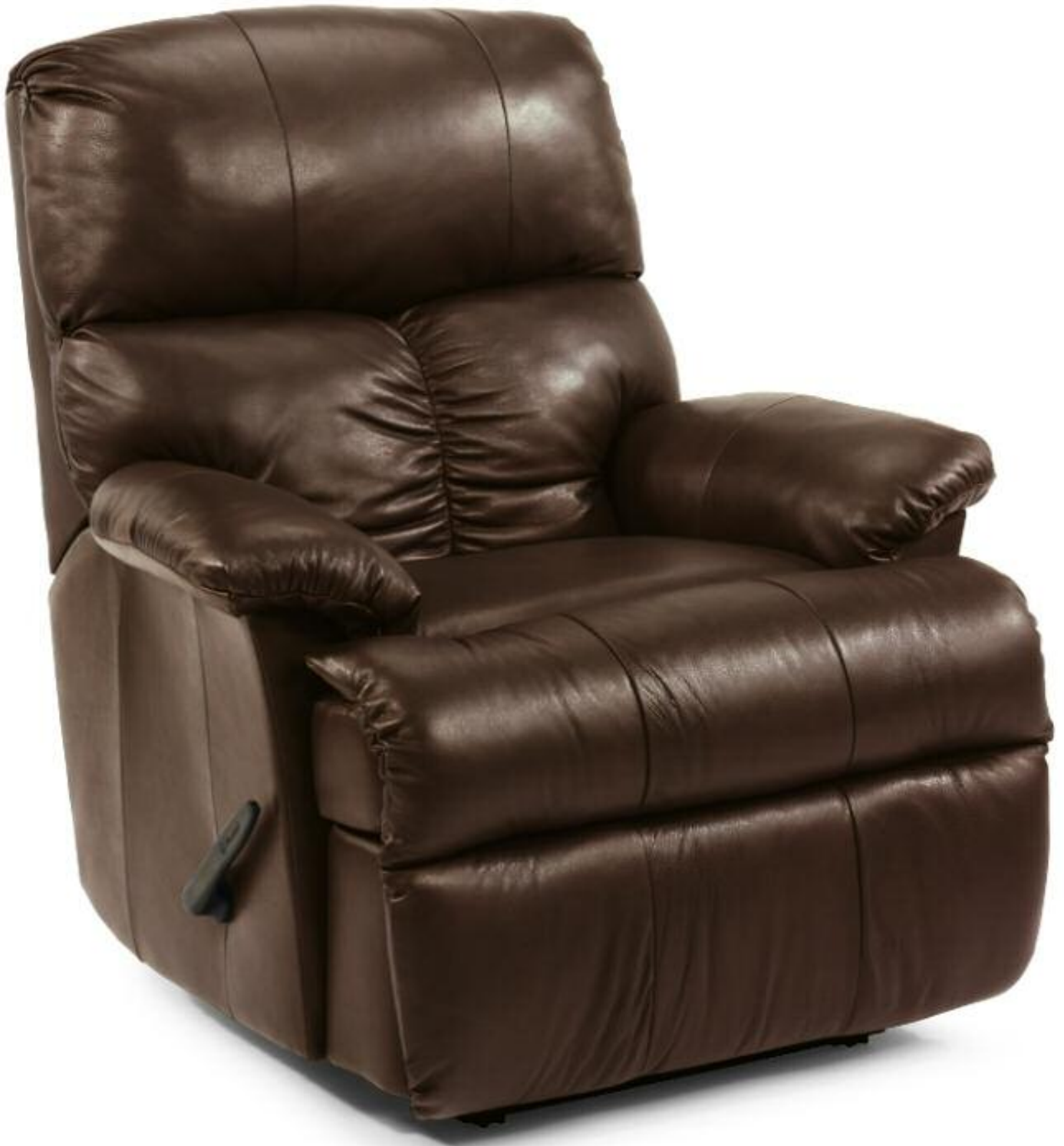
Triton 399R Recliner 47"H x 41"W x 44"D